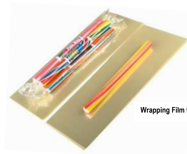
Wrapping Film for Rock Candy Poles